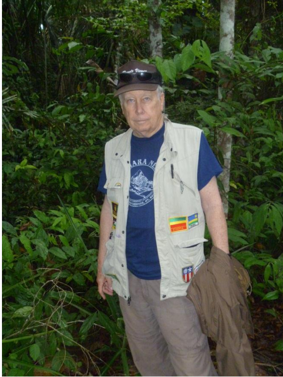
Near Wheelock's ceremony outside Iquitos