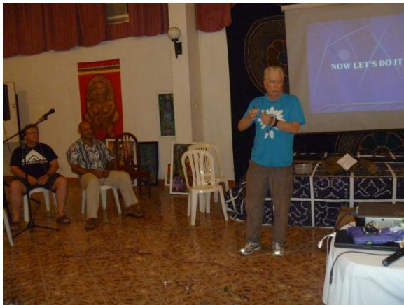
Conducting a metal bending party at the conference – this time it worked.