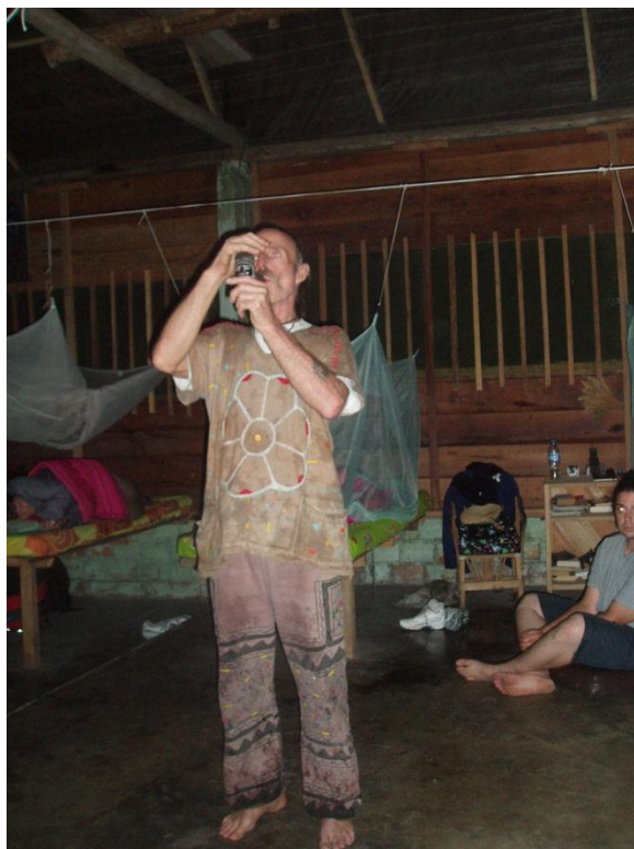
Smudging (cleansing) the area