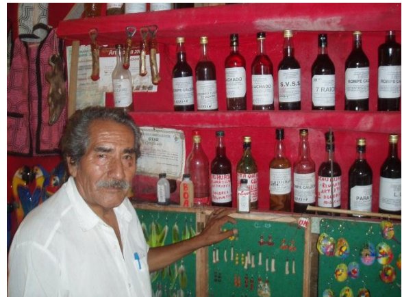
The peoples apothecary shop