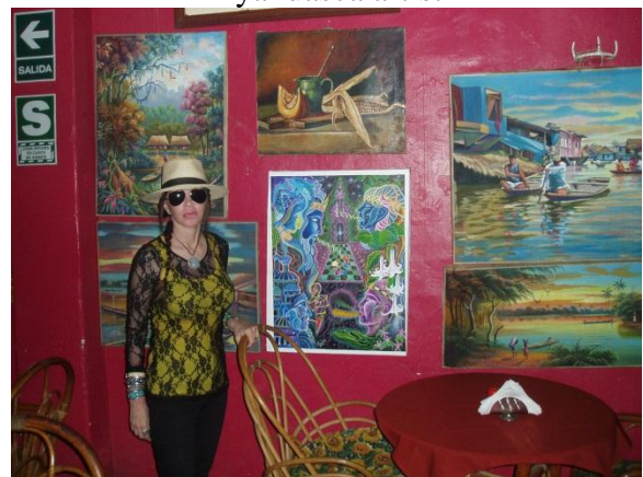
At The Yellow Rose of Texas in Iquitos